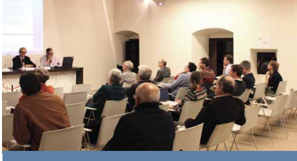
The conference took place in the premises of the Cilengua in the Monastery San Millán de Yuso.

Research into the history of pilgrimage always relies on pilgrimage reports, and therefore these reports already played an important role in