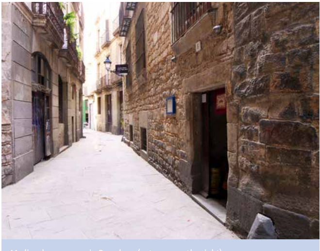
1edieval synagogue in Barcelona (entrance on the right)

make distinctions. Bar Hiyya merges in his letter the main traditions validating astrology within the Jewish religion throughout history, and states that Israel is constrained to practise astrology, for it is alluded to as the specific science of Israel in the Torah (Deut. 4:6).